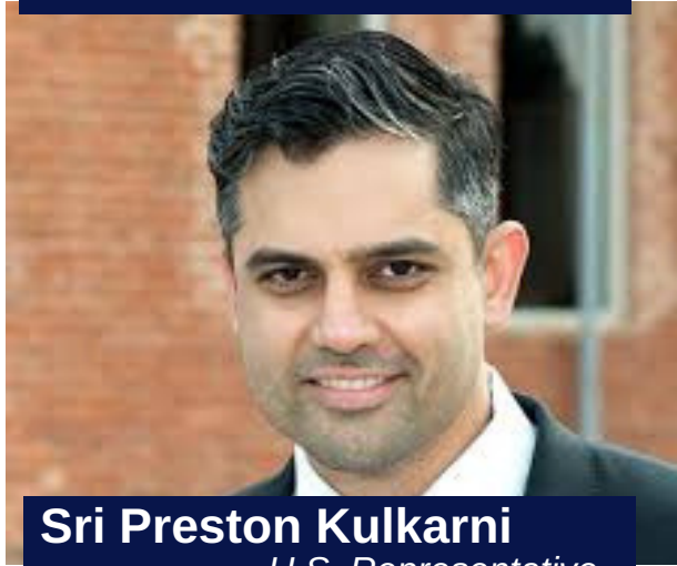
Sri Preston Kulkarni U.S. Representative