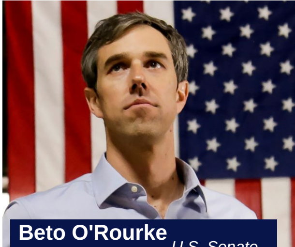
Beto O'Rourke U.S. Senate